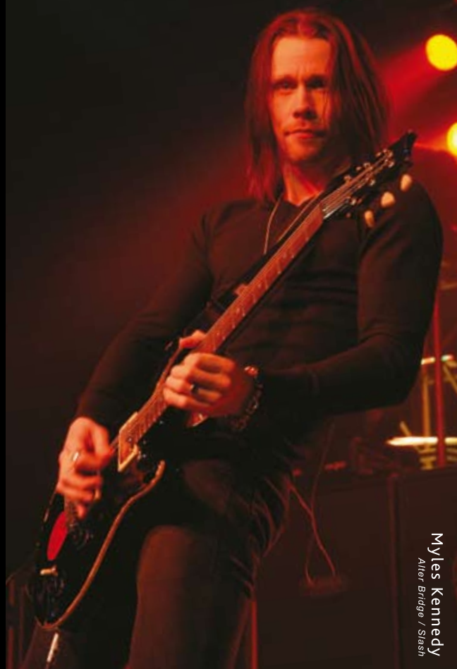
Myles Kennedy Alter Bridge / Slash