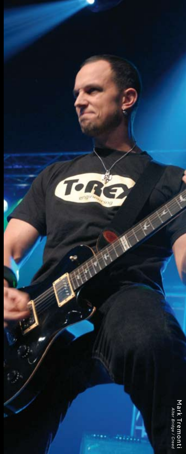
Mark Tremonti Alter Bridge / Creed