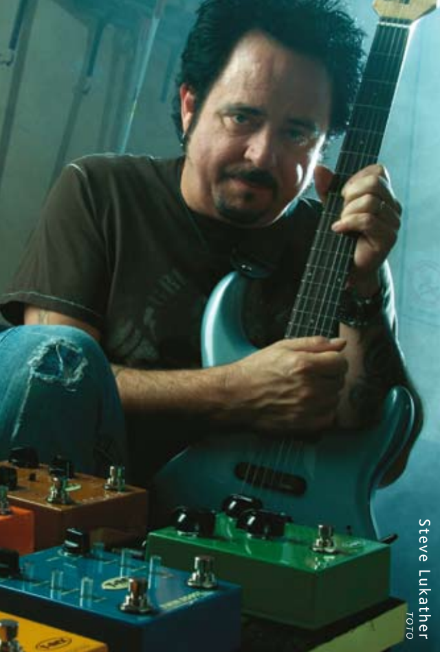
Steve Lukather TOTO