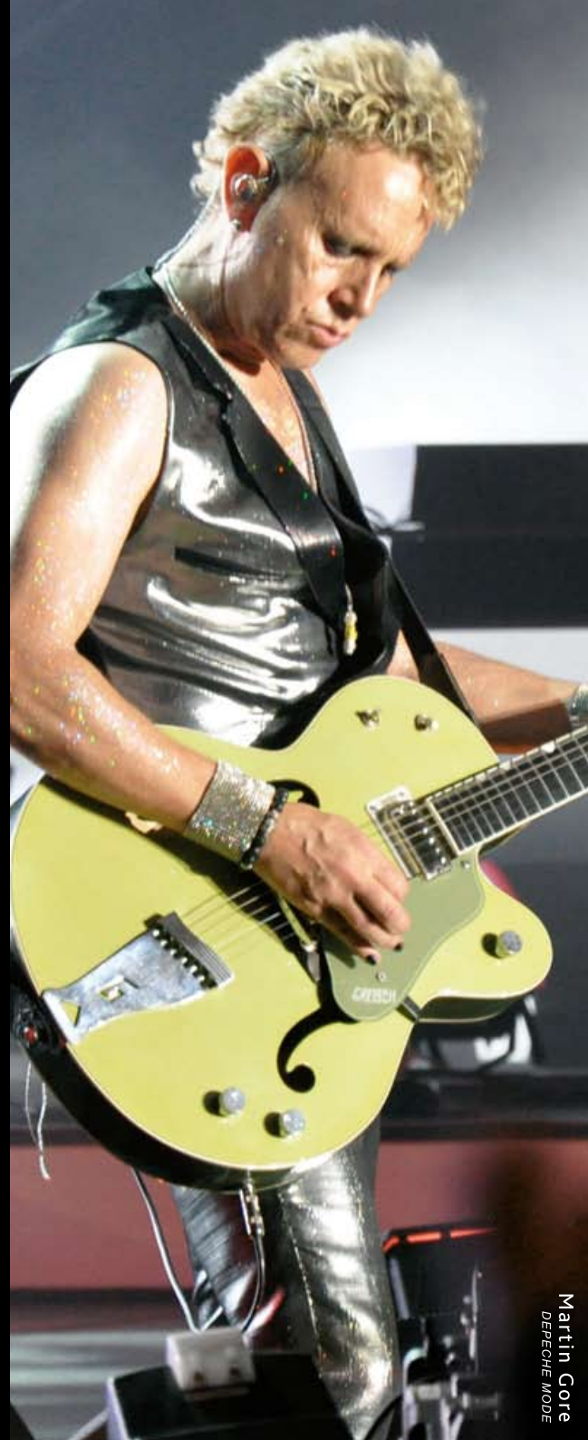
Martin Gore DEPECHE MODE