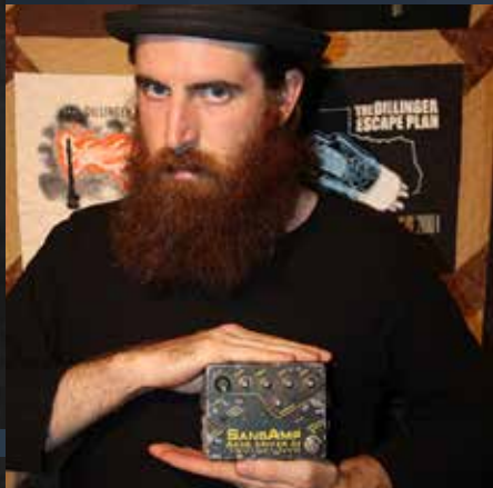
LIAM WILSON THE DILLINGER ESCAPE PLAN