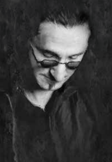
GEDDY LEE - RUSH

Check out all the artists in Tech 21's Hall of Fame at: www.tech21nyc.com/halloffame