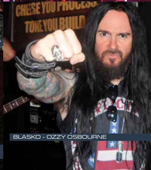
BLASKO - OZZY OSBOURNE