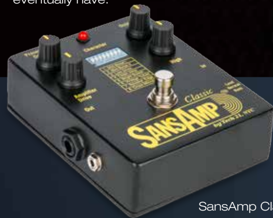
SansAmp Classic ('89)

Tech 21 continually strives to offer player-friendly, truly useful, flexible, multi-functional, roadworthy, workhorse products. In a world of planned obsolescence and constant upgrades, many of our products have changed little, or not at all, and are still in production today, including the ones below.