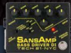
SansAmp Bass DI/ Bass Driver DI ('92)