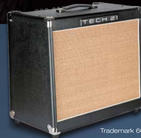
Trademark 60 ('96)