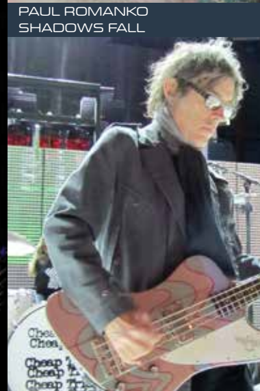
TOM PETERSSON - CHEAP TRICK