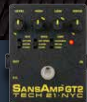
SansAmp GT2 ('93)