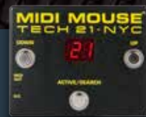
MIDI Mouse ('95)