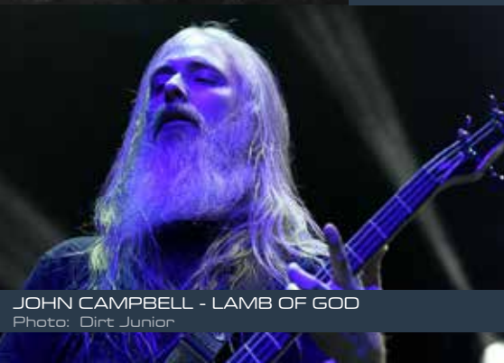
JOHN CAMPBELL - LAMB OF GOD